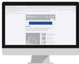
FULL BANNER: NEWSLETTER: Dimensions: 468x60 px