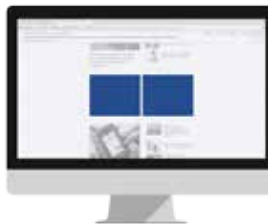
SQUARE BANNER: NEWSLETTER Dimensions: 300x250 px