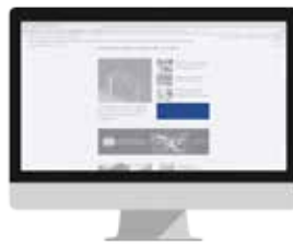
HALF BANNER: NEWSLETTER Dimensions: 234x60 px