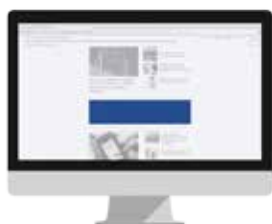
SPECIAL BANNER: NEWSLETTER: Dimensions: 600x140 px